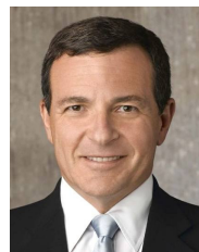
Disney CEO Robert Iger

John saw a cup, so therefore the cup is figurative. Since the cup is figurative, then “drunk with the wine of her prostitution” is also figurative. What do these figure represent? They represent a