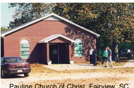
Pauline Church of Christ, Fairview, SC

Saturday, October 25, 1997, 6:50 p.m. Darkness had just settled upon the Pauline Church of Christ in Fairview, South Carolina, Outside, the earth cooled beneath the cornstalks and