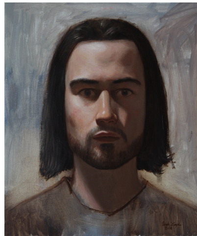
SHEM: ONE OF EIGHT SURVIVORS

I keep telling people that this era of grace had a beginning, and it will have an end. Many refuse to believe it; this era is all they have known. They are like the scoffers of 2 Peter 3:3-4, who think