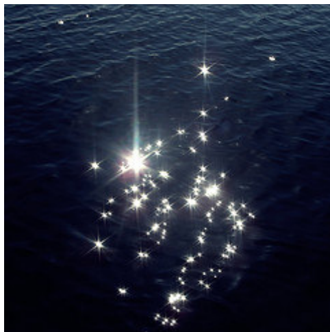
The multifarious wisdom of God

If God's only interest is saving people from a horrible doom, why wouldn't one gospel be enough? Okay. I'm God, and here's my way of thinking: Give the law, show man's incapacity to accomplish its precepts, send a Sacrifice for sin, get people to put faith in the Sacrifice (and not in their own works), eventually tender faith to all, and then consummate my long-term purpose by subjecting everything to myself.